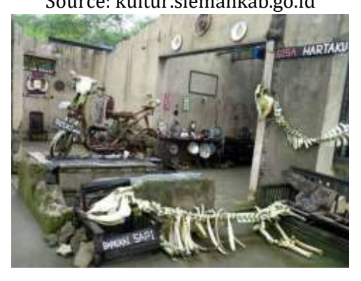
Figure 1.3 Sisa Hartaku Museum

Sema Wayah Trunyan, Bali has a unique funeral tradition. People who died there were not buried or cremated, but only placed under the Taru Menyan tree. This tree will be able to eliminate the smell of the corpses there. The number of bodies placed under Taru Menyan cannot exceed eleven people. Apart from that, there are several conditions that must be met, including dying naturally, being married, having complete body parts. Those who die according to the above conditions will be buried in Mepasah (placed under the Taru Menyan). The burial area is called Sema Wayah.