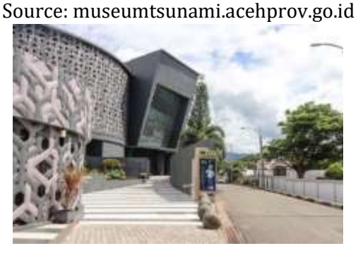
Figure 1.1 Aceh Tsunami Museum

The Lapindo Mud Tragedy Monument, which was created in 2014, presents the work of an artist named Dadang who created and distributed works of art in the form of human statues in the mudflow area. The sinking of the statue from time to time indicates that hot mud is still a real threat to local residents. This monument was created to reflect on the tragedy of the Sidoarjo hot mudflow in 2006 which drowned dozens of villages.